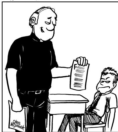
“So, a queen bee that’s annoyed has a ‘bee attitude?’ You may not study but you’re certainly creative.”