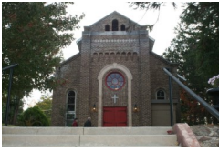
St. Joseph Catholic Church 1914 18 th Avenue