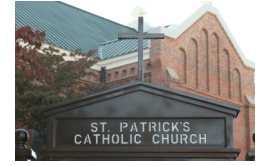
St. Patrick Catholic Church 2601 Davis Street